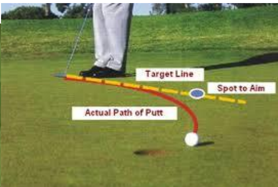
Camillo Villegas uses the "snake technique" to read the break of his putts.